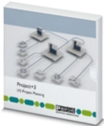
Configuration tool for Inline and Axioline F-I/O stations (free download)

Please be informed that the data shown in this PDF Document is generated from our Online Catalog. Please find the complete data in the user's documentation. Our General Terms of Use for Downloads are valid ( http://phoenixcontact.com/download )